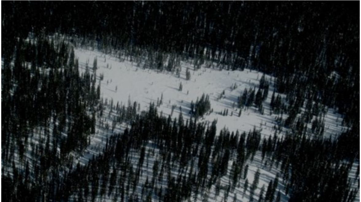
Photo of snowmobile tracks on Bunchgrass Meadow within closure