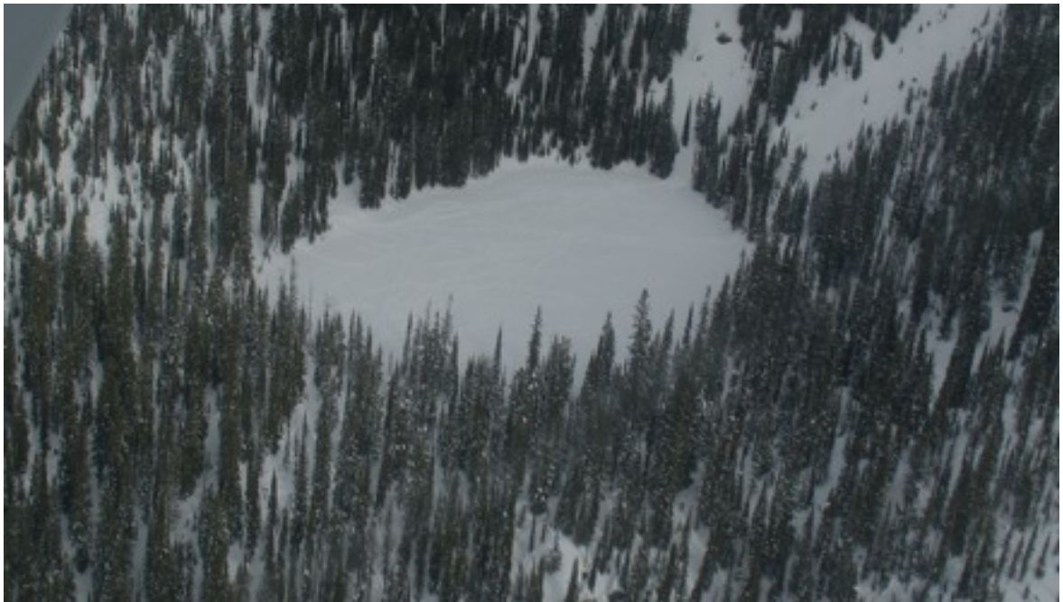
Photo of snowmobile tracks on lake that is west of Big Snowy Mountain.