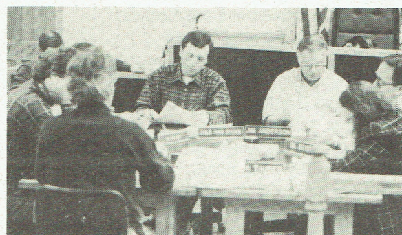
DELIBERATING. Planning Commission members consider the Huckleberry Bay application March 19.