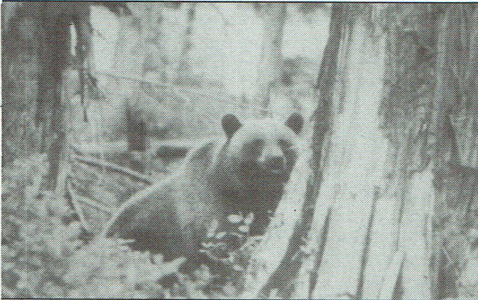
GOODBYE, SY: The Selkirk's most famous grizzly has been killed.