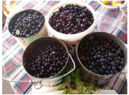
Some huckleberry years are “bear” years